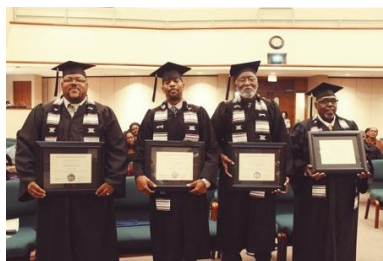
Pictured: Class of 2016